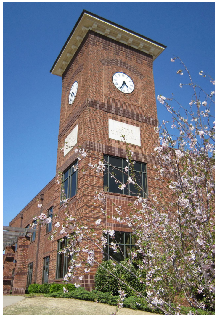
Greer City Hall Event Center

Learn how to recognize subtle signs of child abuse and neglect and signs of human trafficking as required by a new SC Child Abuse Law which mandates that reporters have knowledge of human trafficking signs. Photos of child abuse injuries will be used in the presentation and scenarios will be discussed.